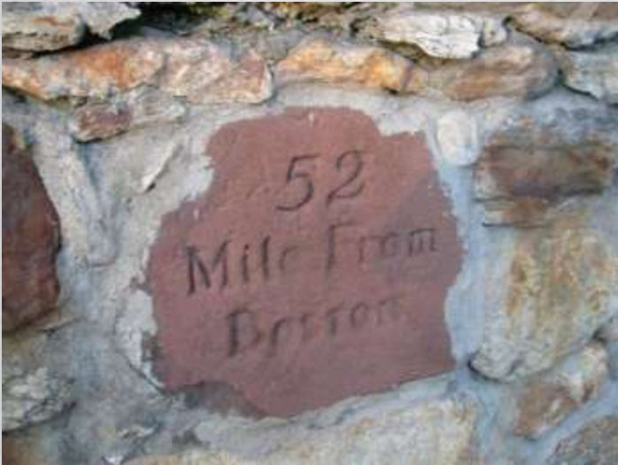
View of the marker. Photographed circa September 2008.