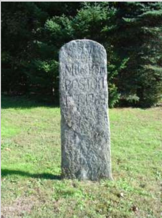
View of the marker. Photographed October 2011.