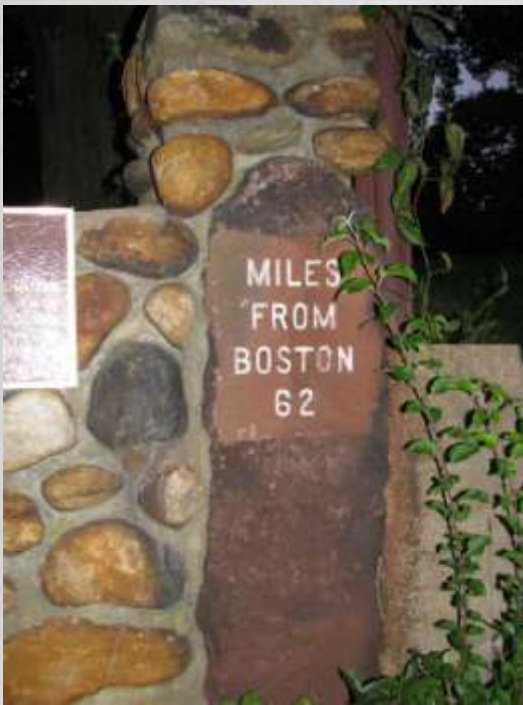
View of the marker. Photographed September 2008. Photo courtesy of Waymarking.com, user BruceS.

Closeup view of the plaque next to the marker. Photographed September 2008. Photo courtesy of Waymarking.com, user BruceS.