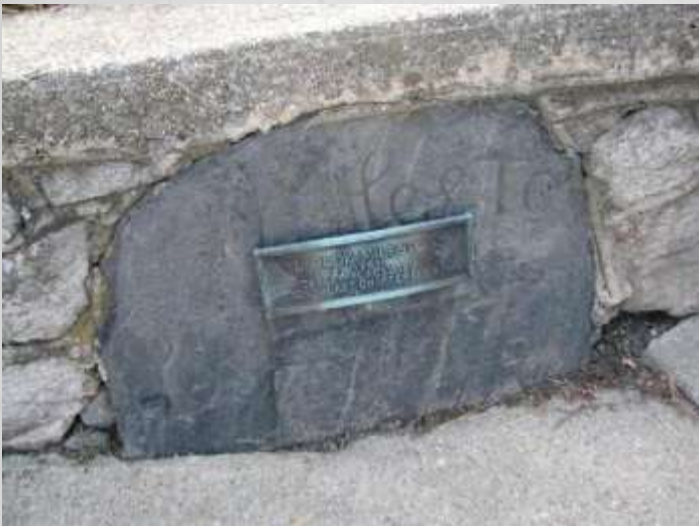
View of the marker. Photographed October 2008.