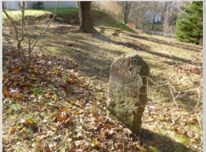
View of the location. Photographed November 2011.