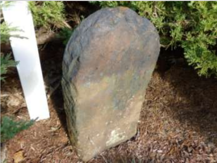
View of the marker. Photographed November 2011.