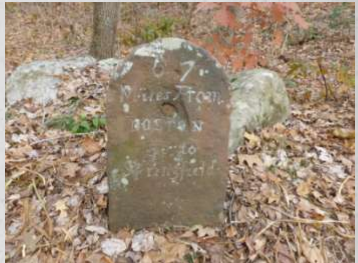
View of the marker. Photographed November 2011.