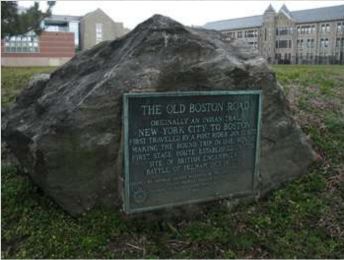
Photographed March 2012.