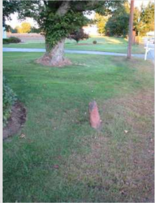
View of the location. Photographed circa September 2008.