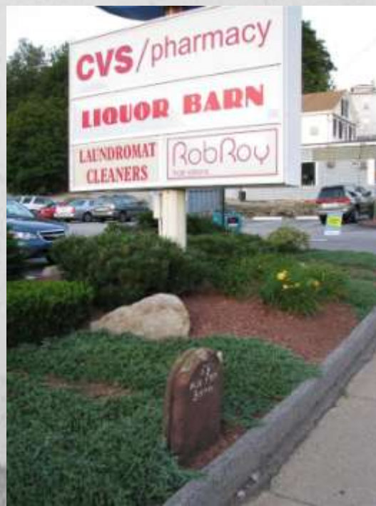
View of the location. Photographed September 2008.