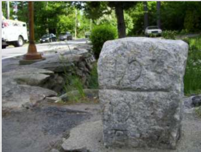
View of the marker. Photographed May 2009.