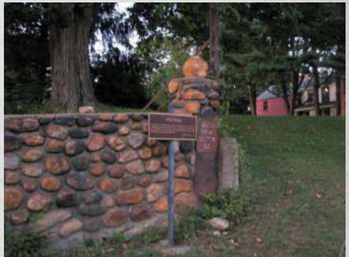
View of the location. Photographed September 2008. Photo courtesy of Waymarking.com, user BruceS.

Closeup view of the plaque next to the marker. Photographed September 2008. Photo courtesy of Waymarking.com, user BruceS.