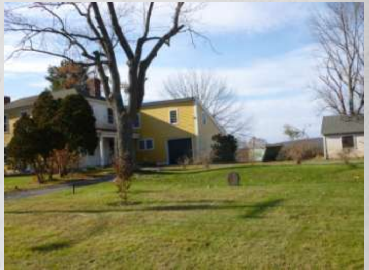
View of the location. Photographed November 2011.