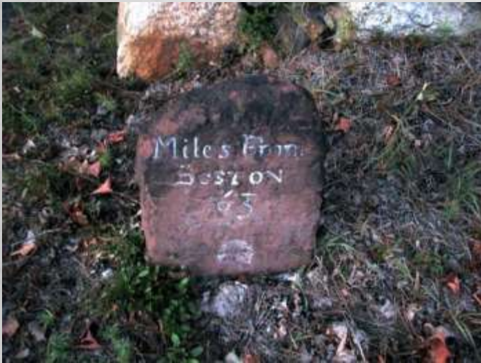
View of the marker. Photographed September 2008.