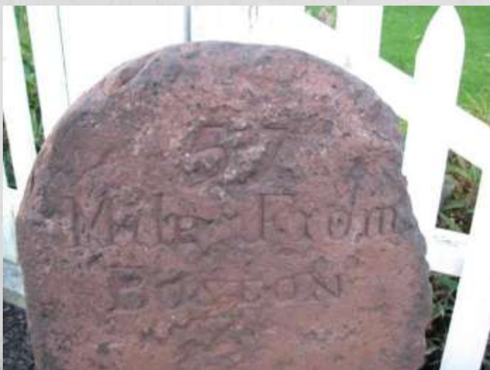
Closeup view of the marker. Photographed September 2008.