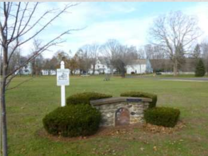
View of the location. Photographed November 2011.