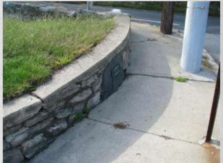
View of the location. Photographed October 2008.