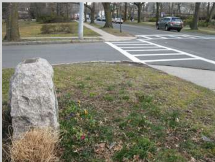
Photographed March 2012.