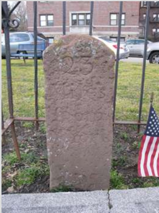
All photographs from March 2012.