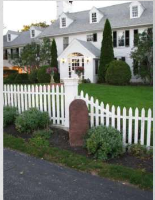
View of the location. Photographed September 2008.