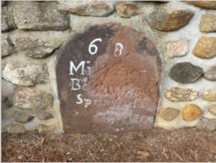
View of the marker. Photographed November 2011.