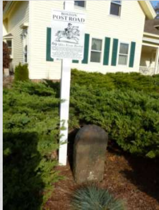
View of the location. Photographed November 2011.