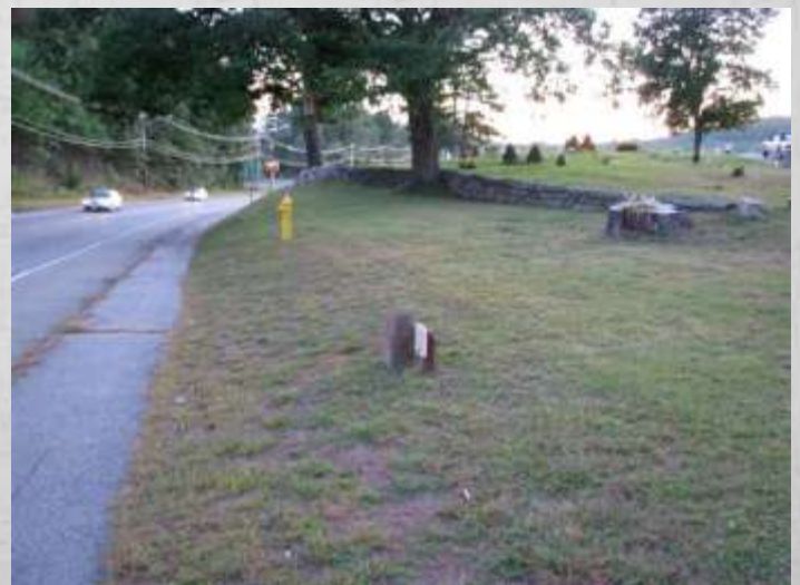
View of the location. Photographed September 2008.