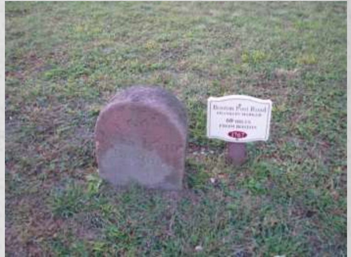
View of the marker. Photographed September 2008.