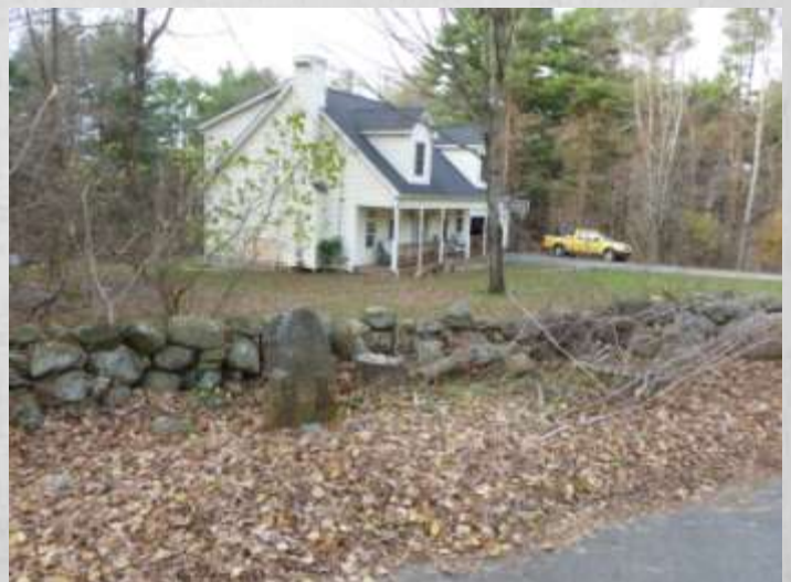
View of the location. Photographed November 2011.