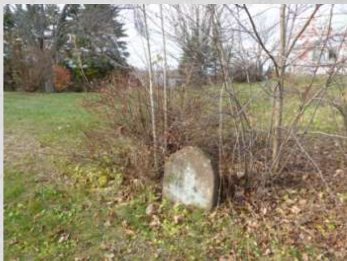
View of the location. Photographed November 2011.