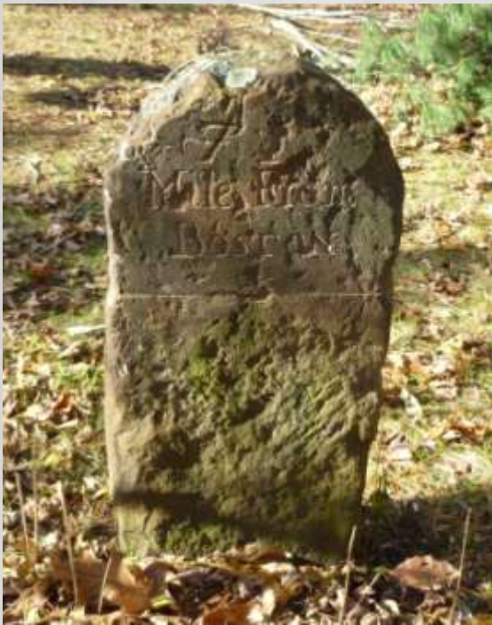
View of the marker. Photographed November 2011.