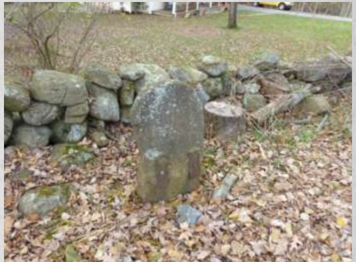
View of the location. Photographed November 2011.