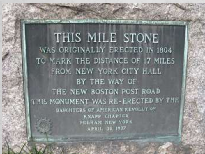
Photographed March 2012.