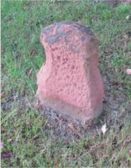
View of the marker. Photographed circa September 2008.