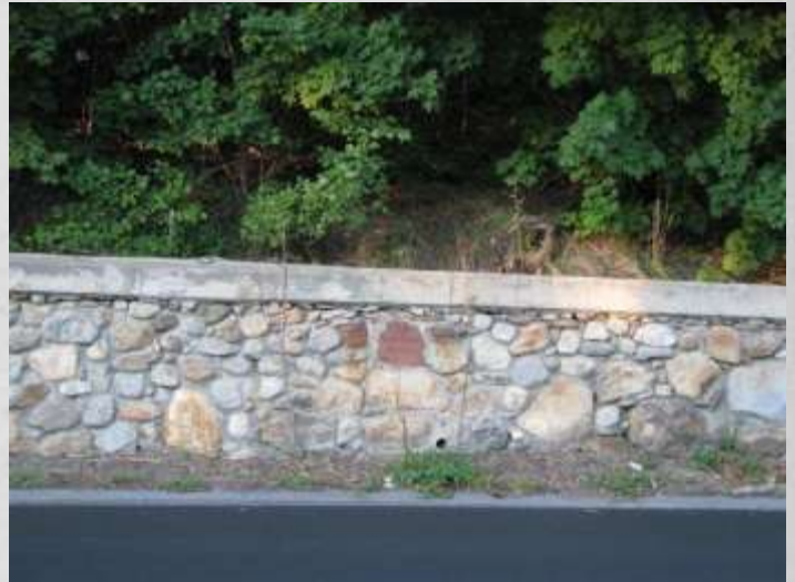
View of the location. Photographed circa September 2008.