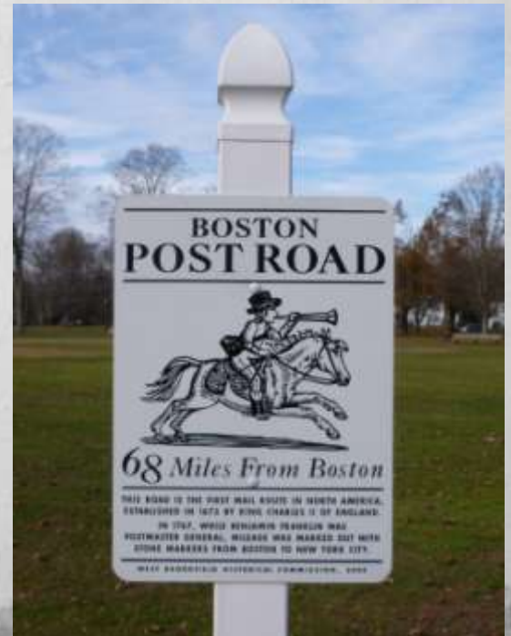
View of the sign. Photographed November 2011.