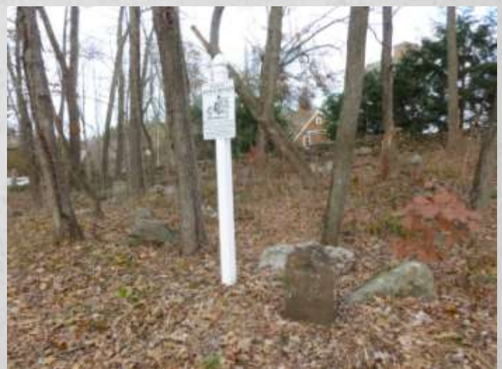
View of the location. Photographed November 2011.