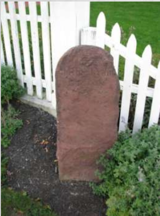
View of the marker. Photographed September 2008.