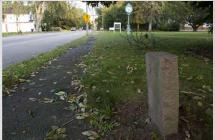
All photographs from September 2011.