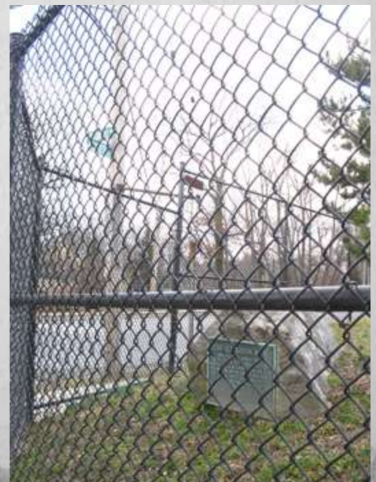
Photographed March 2012.