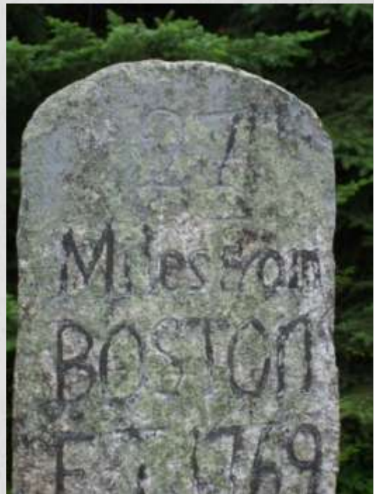
Closeup of the marker text. Photographed June 2009.