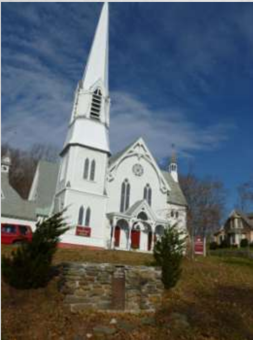
View of the location. Photographed November 2011.