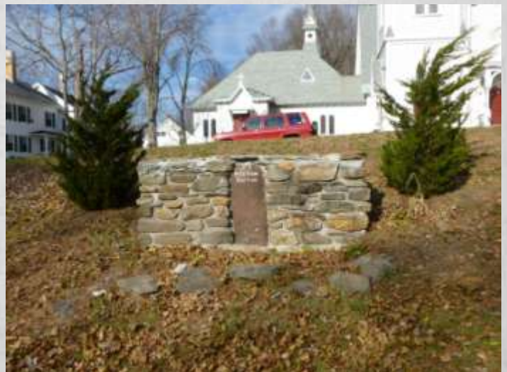
View of the location. Photographed November 2011.