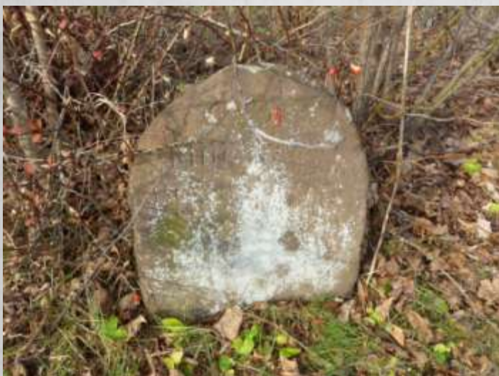
View of the marker. Photographed November 2011.