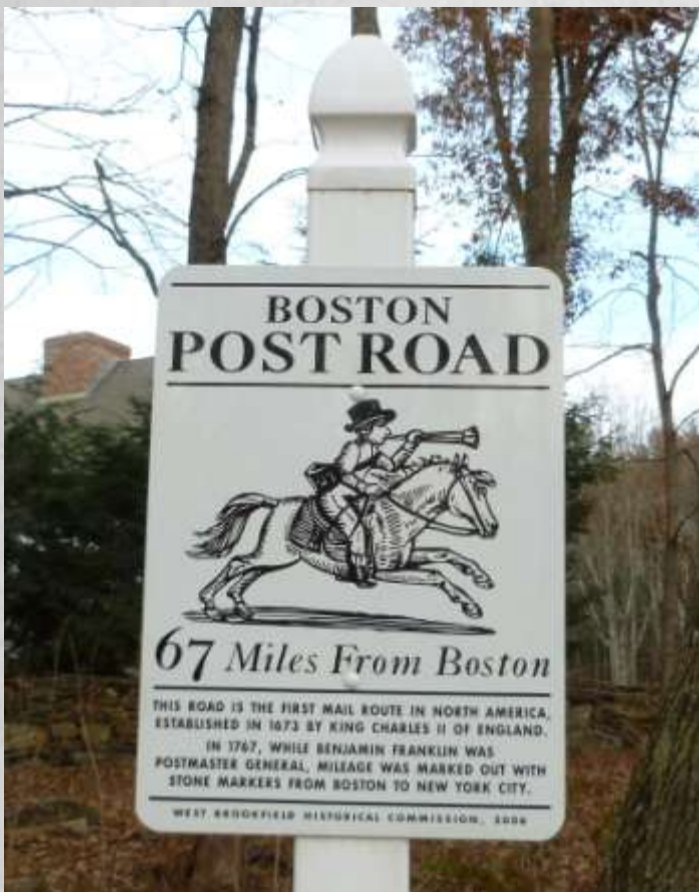
View of the sign. Photographed November 2011.