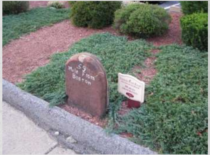
View of the marker. Photographed September 2008.