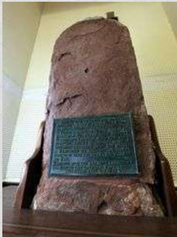
Marker 26. Photo from source #1.