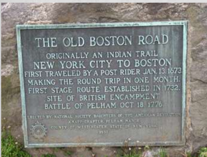
Photographed March 2012.