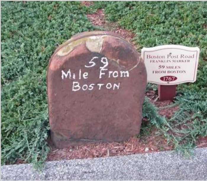
View of the marker. Photographed September 2008.