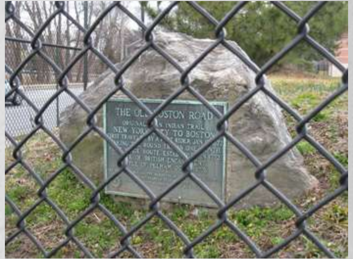
Photographed March 2012.