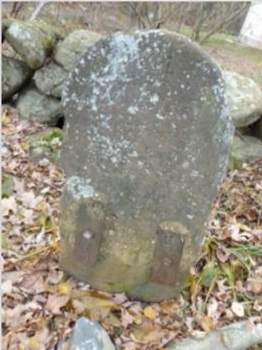
View of the marker. Photographed November 2011.