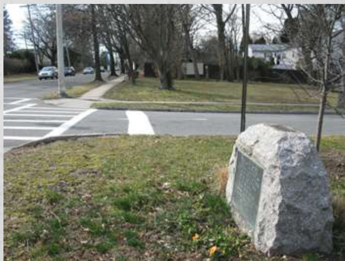
Photographed March 2012.