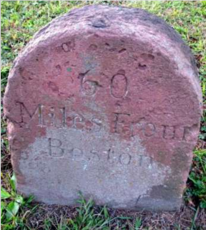
Closeup view of the marker. Photographed September 2008.