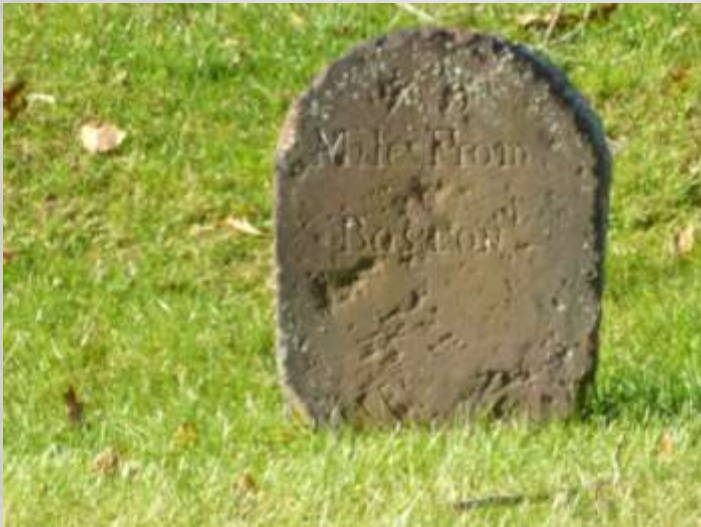
View of the marker. Photographed November 2011.