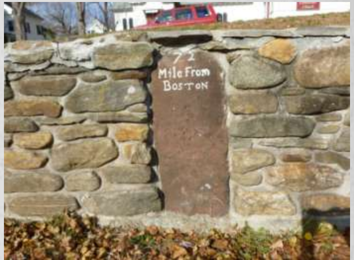
View of the marker. Photographed November 2011.