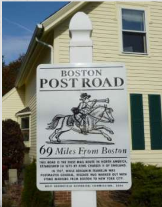
View of the sign. Photographed November 2011.