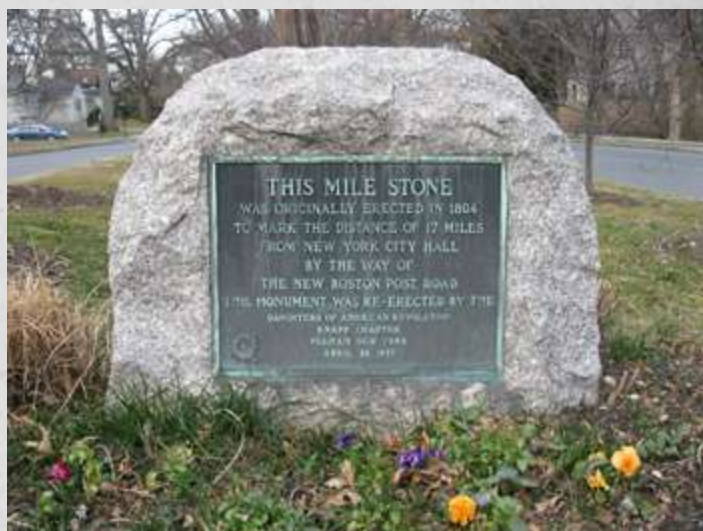
Photographed March 2012.