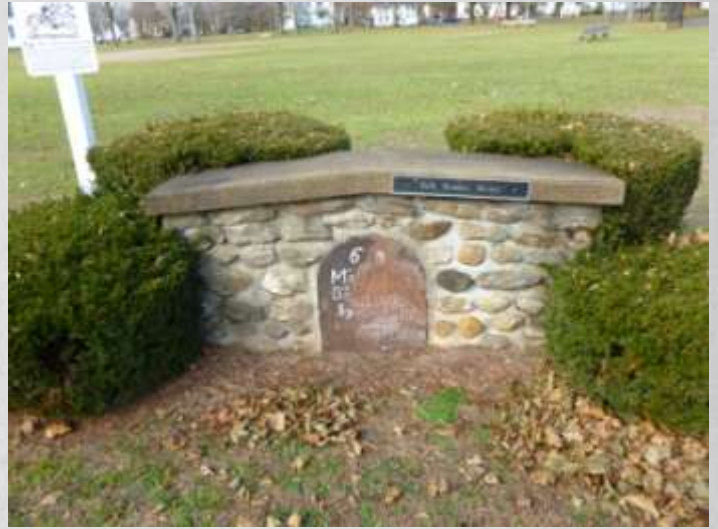
View of the marker. Photographed November 2011.