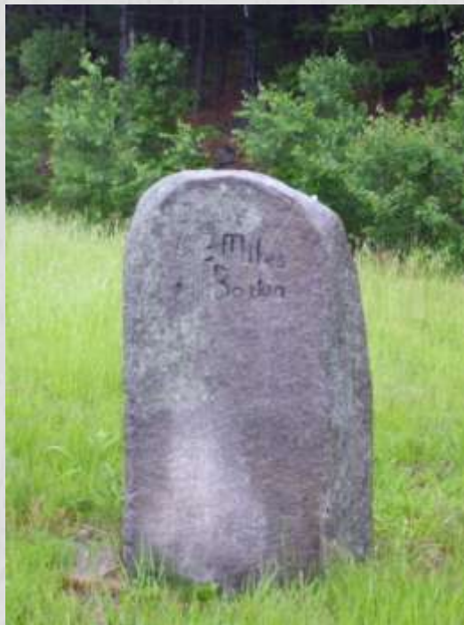
View of the marker. Photographed circa June 2009.