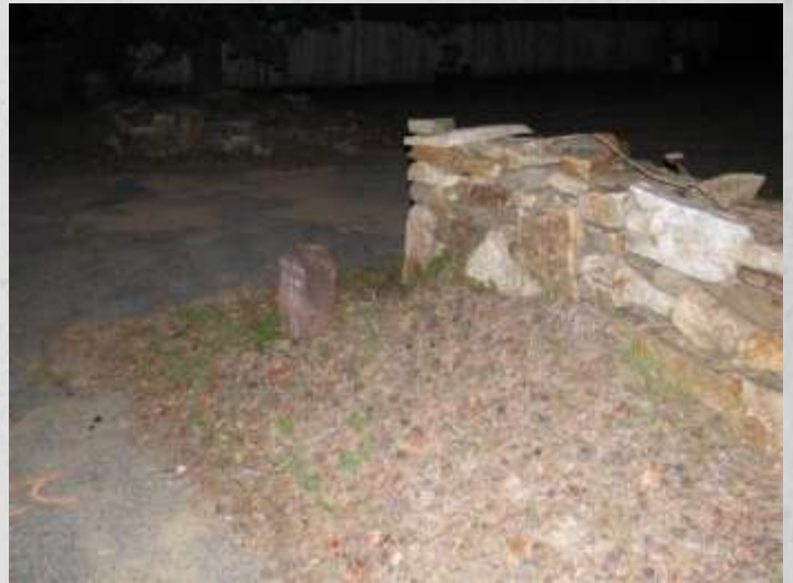
View of the location. Photographed September 2008.