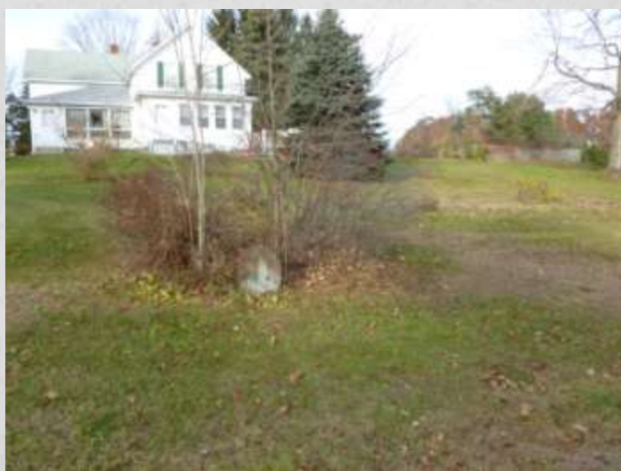
View of the location. Photographed November 2011.